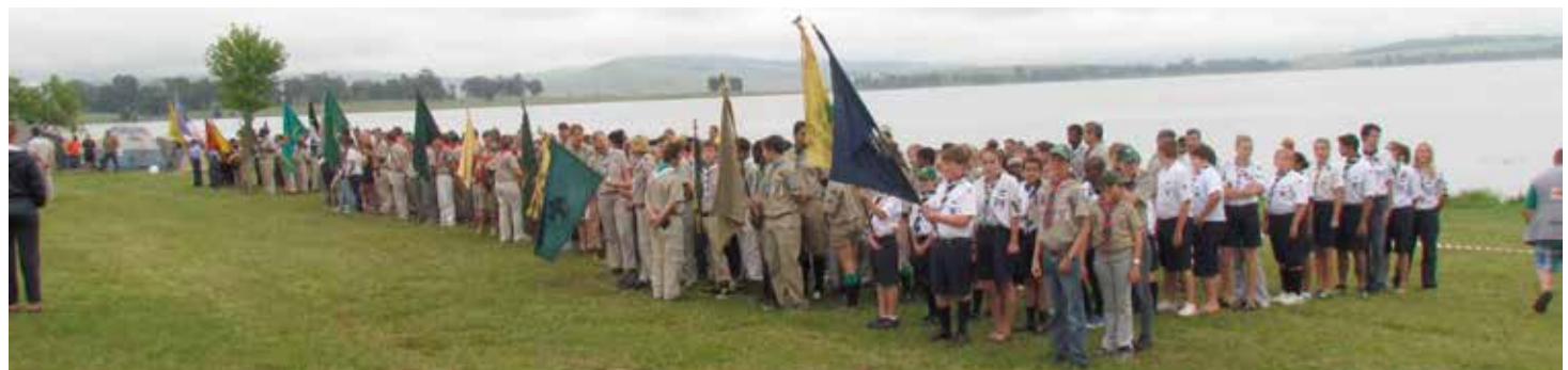
KZN Scouts, with their group flags on the banks of Midmar Dam shortly before the BP service.

With the amazing growth of the annual KZN Scout raft race, it makes sense to use this occasion to celebrate BP Sunday with a combined service early on the Sunday morning before the raft race gets underway. Against the back drop of the magnificent rolling midlands hills this is surely a most fitting venue to reflect on and celebrate the life of our founder, Lord Robert Baden-Powell.